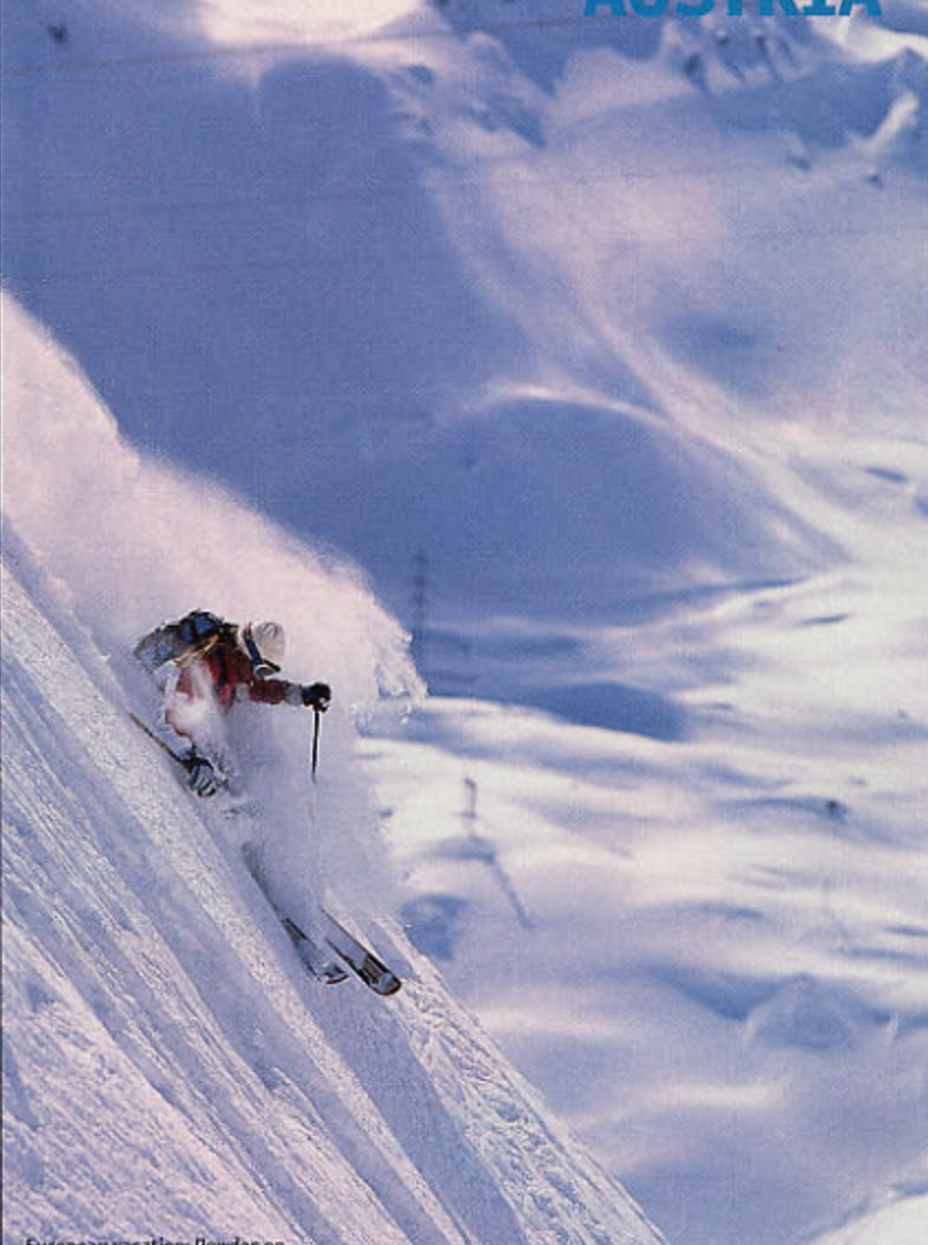
European vacation: Powder en route to the Postkeller.

everyone here seems to be young, single, and urban. It's not a good place for the 50-and-over Deer Valley crowd.